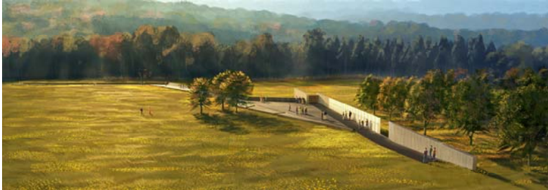
Flight 93 Memorial Design Plan