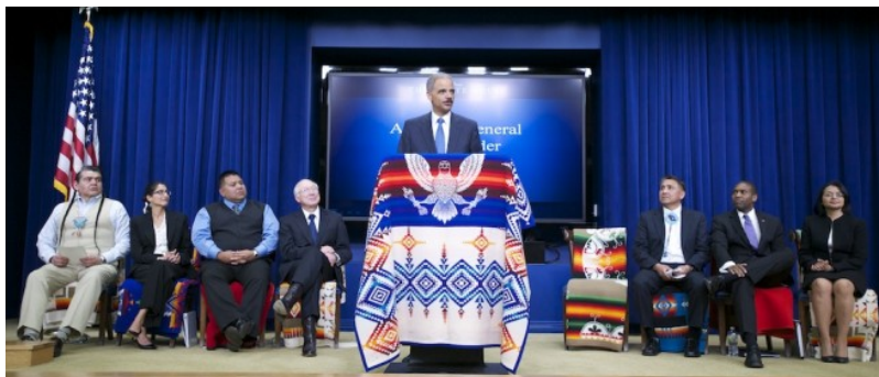
Attorney General Eric Holder announces the settlement of breach-of-trust lawsuits filed by more than 40 federally recognized American Indian tribes against the United States.

responsibilities include cases in virtually every United States district court of the Nation, its territories and possessions, the United States Court of Federal Claims, and in state courts. The subject matter involves federal land, resource and ecosystem management decisions challenged under a wide variety of federal environmental statutes and affecting more than a half-billion acres of lands managed by the Departments of the Interior and Agriculture (totaling nearly one-quarter of the entire land mass of the United States) and an additional 300 million acres of subsurface mineral interests; vital national security programs involving military preparedness and border protection, nuclear materials management, and weapons system research; billions of dollars in constitutional claims of Fifth Amendment takings covering a broad spectrum of federal activities affecting private property; challenges brought by individual Native Americans and Indian tribes relating to the United States' trust responsibility; a panoply of cultural resource matters including cases related to historic buildings, repatriation of ancient human remains and salvage of shipwrecks; preserving federal water rights and prosecuting water rights adjudications; ensuring proper mineral royalty payments to the Treasury; and litigation involving offshore boundary disputes, interstate water