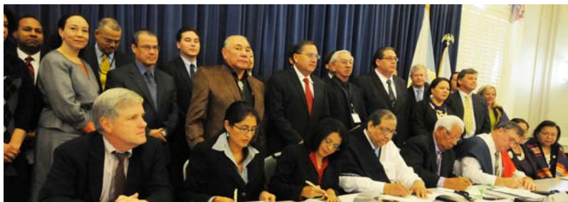
Federal officials and Tribal leaders commemorate the final settlement of historic trust accounting and trust management claims.

The Division also defends claims brought by tribes. Under settlements reached in the spring of 2012, the United States will pay a total of more than $1 billion to 41 tribes in compensation of the tribes’ claims regarding the government’s management of trust funds and non-monetary trust resources. And in October 2011, the Osage Tribe and the United States agreed to a historic settlement of the tribe’s claims for $380 million.